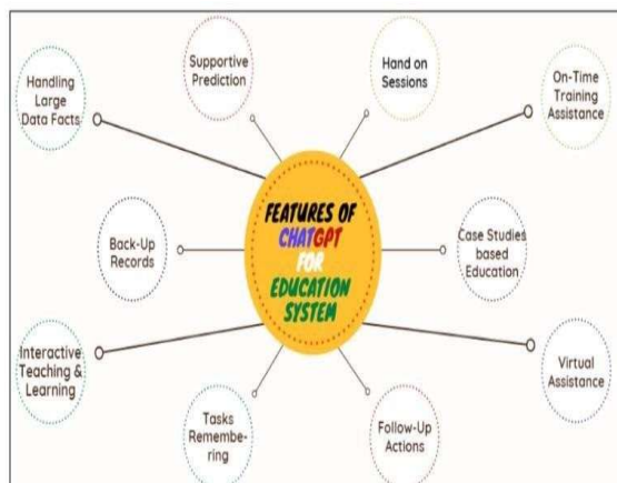
Figure 1. The impactful capacities of ChatGPT within the educational system

Teachers and students can generate a wide range of resources with ChatGPT, such as argument themes, mysteries, writing prompts, and widely more [6]. Students can self-direct their practice and research, and they can produce these as needed.