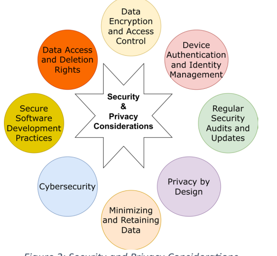
Figure 2: Security and Privacy Considerations

Fog/cloud computing, IoT, and machine learning in robots require security and privacy. Interconnected technologies create security and privacy risks. Figure 2 shows the main security and privacy considerations for the integration.