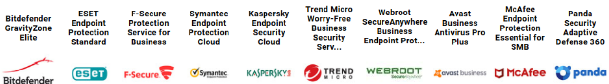
Figure 3. Antivirus applications

Cloud base business programs have evolved a series of programs for HR-related staff training [71]. A person residing in one part of the world like a head office can train and monitor the workforce in another part of the world.