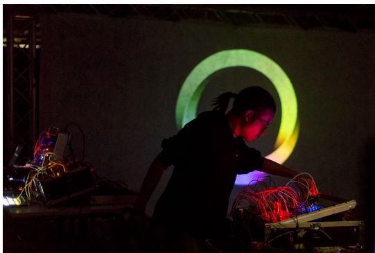
Figure 2. The first author performing with the prototype synthesizer at Ääniaalto 2018

The currently developed instrument in an audiovisual setting very clearly adheres to audiovisual composition where image and audio are both modulated from a third control voltage source [13]. Patching amplitude envelopes to the audio source as well as a parameter in the video synth creates immediate synchronicity towards building added value [8]. Patching gate sequences to 'system' and 'subsystem' in time with audio intervals also creates distinct sound-image events and compositional structures [18]. For example, gate sequences clocking the main sequence can be patched in parallel to change the 'system' or 'subsystem' parameters. Within a patch, the envelope driving the amplitude can be used to also change any CV-addressable parameter of a shader.