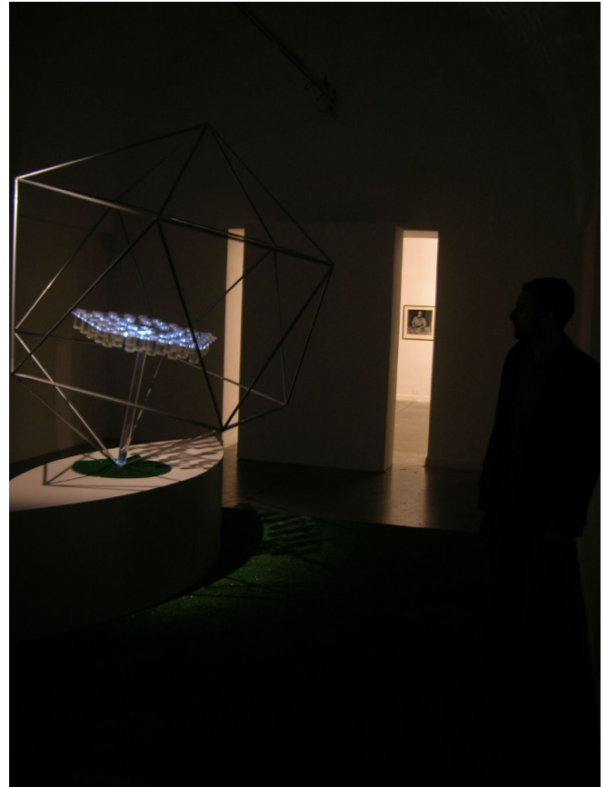
Figure 1. Grupo Proyecto Untitled and Joaquín Fargas, Incubaedro (2008).

These activated a fan, which imitated the movement of the wind; a water pump, which simulated rainfall; and a pulley system, which brought an in vitro orchid out of an acrylic hemisphere, alluding to the birth of a new kind of organism designed in the laboratory.