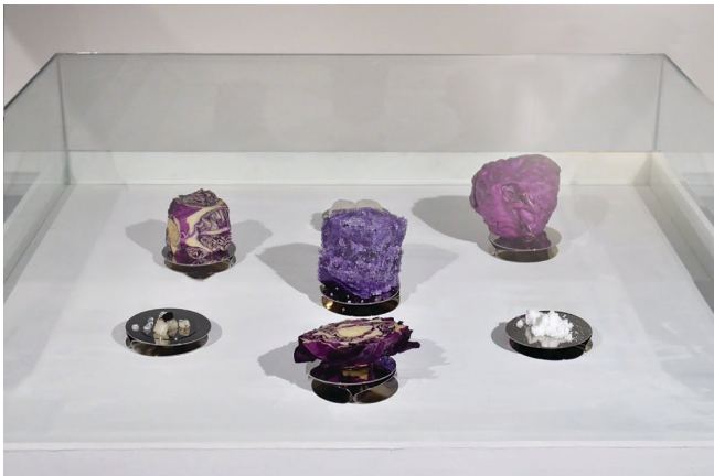
Figure 5. Agustín Bucari, Morfogénesis S/Z (2018).

The installation, Morfogénesis S/Z [Morphogenesis S/Z] (2018) shows the different states of two materials: red cabbage ( Brassica oleracea ) and Potassium alum (Fig. 5). These materials were chosen based on the concepts of what the organic and the inorganic, not as a binary opposition, but rather as malleable, converging qualities that relate to one another. For example, when creating alum crystals, terms like “cultivation,” “germination,” or “growth” are used, which evoke organic characteristics. However, when Bucari observed cabbage leaves under the microscope, he found a structure of rigid, straight lines, a geometric pattern that repeats itself and relates to the inorganic forms of the design. The artwork is thus not only about the ambiguity between the organic and the inorganic but also the crossover between art and science.