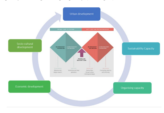
Figure 2. ECAS development cycle

'systemic approach' identified by the Waterloo Institute for Social Innovation and Resilience [20], acknowledges how emergent needs are often adapted to existing systems [21]. The intention in ECAS is to develop a circular, design-led approach that incorporates understanding of a 'think like a system, act like an entrepreneur approach', following a design thinking logic akin to the double diamond proposed by Conway, Masters and Thorod [22]. In this conceptualization, the first diamond is about the problem discovery and understanding systemic conditions. The second diamond is about understanding how to act opportunistically like an entrepreneur to achieve change. Firstly, specific emphasis is put on the stages of learning ecosystem development, and secondly, the impact of learning ecosystems on existing learning provision [19]. The key principles of sustainability: environmental, social and economic, will be explored alongside pillars of knowledge-based urban sustainable development: socio-cultural development, economic development, sustainability development, capacity, and organizing capacity (see Fig. 2).