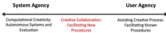
Figure 1. Current Creativity System Design from Autonomous Systems to CSTs

technology [9][10][16][11]. Currently within choreography, computers are used as CSTs to design the presentation of performance (set, lighting, sound, costume). While the limitations of using technology as such will impact choreographic decisions, choreographers often respond to these outside limitations with reinforced use of their own movement habits and styles. We are interested in how computers can be engaged within the creative choreographic process to impact habits and style, to shift attention to particular aspects of experience and suggest new choreographic choices.