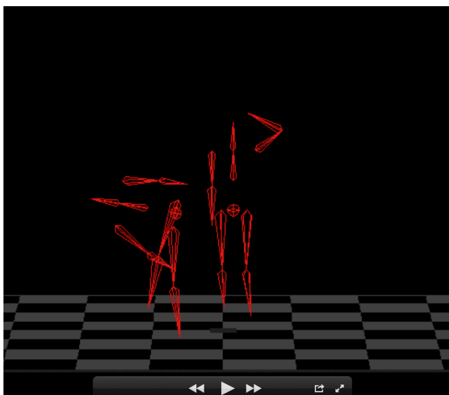
Figure 6. Choreographer Working with Kinect, Integrate and DanceForms Systems

was also a narrow spectrum of capture opportunities for a dancer. The available floor space for capture is small (oriented towards gamers fixated on a screen), the camera still needs to see recognizable limbs even with the depth camera (limbs are easily lost and replaced as standing still), sudden changes of movement or tempo are often lost. Many movements were not able to be captured including curved spine, swinging limbs, legs extended above 90 degrees and any sense of weightedness in the movement. This lack of specificity in the movement data constrained the opportunities for manipulating choreographic process computationally. The choreographer made choices towards basic, more easily recognized movements, attempted to move more slowly, not perform work on the ground which had the effect of reducing complexity and novelty. The most prominent creative understanding in the process with the Kinect was that it brings a strong focus to the body's positions, rather than orientation, spatial relationships and quality or expressivity of movement. There are many qualities that lend themselves towards defamiliarization practices, augmenting the original movement in unique positions and jittery interpolations.