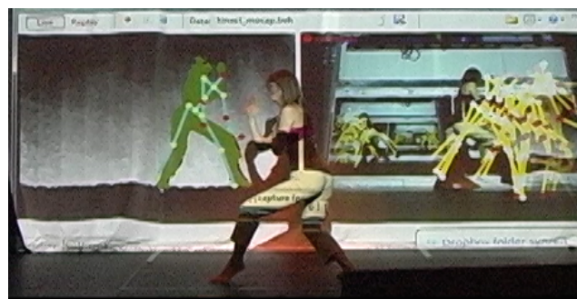
Figure 4. Choreographer Working with Kinect and Integrate Systems

We performed a pilot study to explore what kinds of features could support collaboration in an intelligent autonomous choreographic system. To test our process we devised a critical inquiry by developing a choreography in the studio with the aid of a Wizard of Oz exploration of the interaction between a simulated software tool and a choreographer. Critical inquiry comes from Human Computer Interaction and uses ethnographic methods to collect data in the field, or in situ [18]. Data