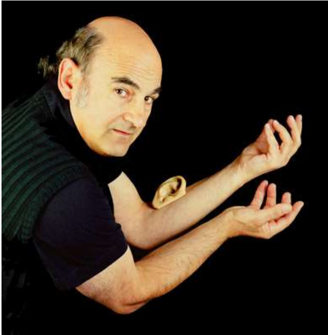
Figure 3. Stelarc implanted a third ear

we would be able to hear the other's voice "as an acoustical presence of another body from somewhere else.