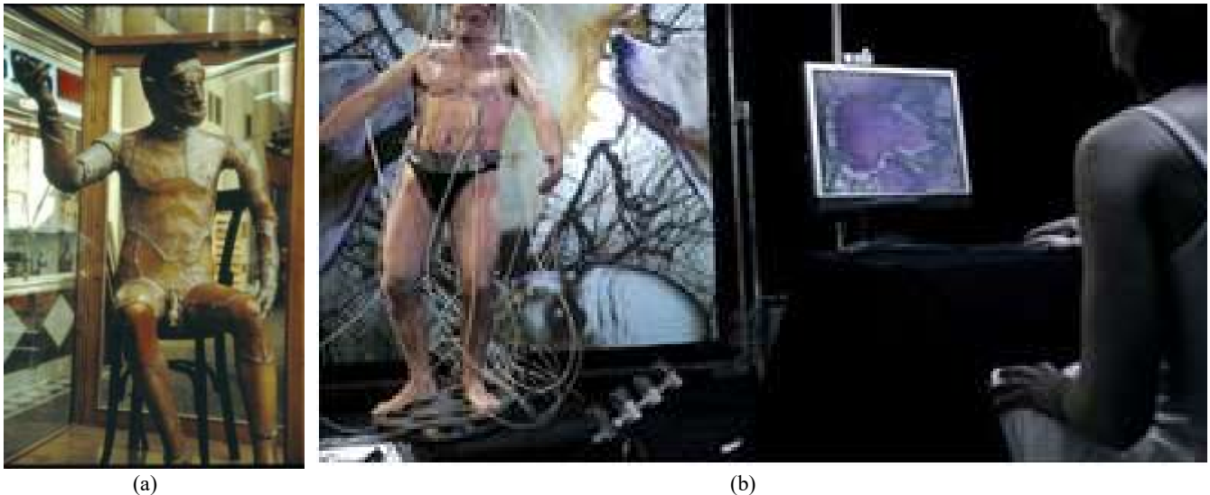
Figure 2. JoAn 1992 (a), Epizoo 1994 (b)

In modern technological societies, Performing Arts follows adapt, assimilate and sometimes suggest new bodies, which will join new worlds, referring to our contemporary visions.