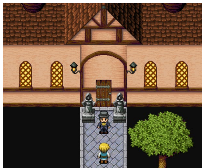
Figure 1. Opening scene of 'Escape with Python' (Graphics by Niklas Humble in RPG Playground)

Design and development of the game prototype was conducted in the game development tool RPG Playground (RPGPlayground.com). This tool enabled the design of a web-based and role-playing inspired game, which could be distributed for testing via a link. The web-based format further enabled testing on multiple devices (such as computers, Chromebooks, and mobile devices), which can be important since many elementary schools use different types of digital devices in the classroom. Inspired by previous research, that has shown promising results on using challenging problem solving in escape rooms for computer science [45, 46], this game was created as a digital escape room that should motivate students and inspire for further learning. The working title of the game is 'Escape with Python' (Fig. 1), and the focus is on the basics of programming with the programming language Python, combined with fundamental ideas from Computational Thinking (CT), such as CT concepts, practices, and perspectives [47].