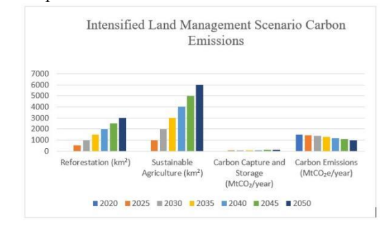
Figure 2. Intensified Land Management Scenario Carbon Emissions

However, the enhanced management of land scenario presents a convincing argument where the trends in sectorial land use are positively adjusted. The reforestation focus, sustainable agriculture, and carbon capture and storage present a potential that initiatives