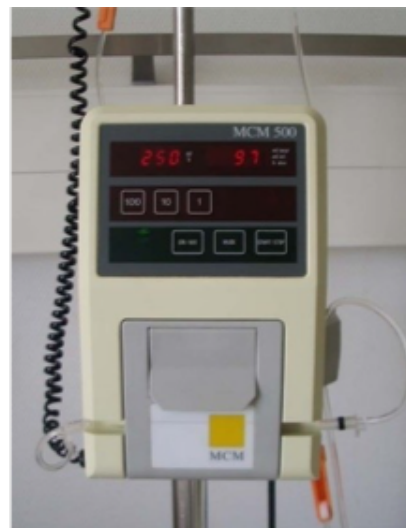
Figure 4. Example vulnerable drug pump.

Insulin pumps (Fig. 4) are medical devices that patients attach to their bodies that injects insulin through catheters. The Animas OneTouch Ping, was launched in 2008, is sold with a wireless remote control that patients can use to order the pump to deliver a dose of insulin, which is typically worn under clothing and can be awkward to reach. Johnson & Johnson recently informed patients that it has learned of a security vulnerability in one of its insulin pumps that a hacker could exploit to overdose diabetic patients with insulin. This system is vulnerable because communications are not encrypted, to prevent hackers from accessing the device. Hackers can force the device to deliver unauthorized insulin injections. The chances of such a hack happening is very low. However, this is the first time a manufacturer of medical devices had issued such a warning to patients about a cyber vulnerability. This revelation has increased concerns about possible bugs in pacemakers and ICDs. J&J is warning customers and providing advice to fix the issue.