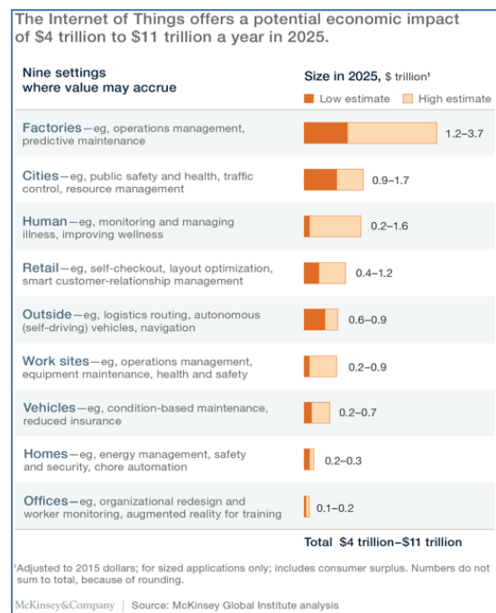
Figure 1. Economic impact of IoT Devices by 2025.

The Healthcare sector remains one of the fastest to adopt the Internet of Things. Integrating IoT features into medical devices improves the quality and effectiveness of service rendered, this is very valuable for patients who have chronic conditions, the elderly, and those requiring constant care. According to a study conducted by McKinsey Global Institute, spending on the Healthcare IoT solutions will reach $1 trillion by 2025 (see Fig.1). It is possible that this could set the stage for highly personalized, accessible, and on-time healthcare services for everyone.