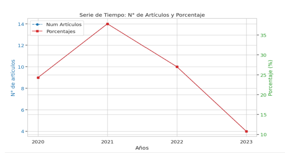
Trend of the scientific production of Neural Networks for the diagnosis of Covid-19 in Chest X-ray images.

A growth trend in the dynamics of publications is evidenced over various time intervals. Initially, in the year 2020, a