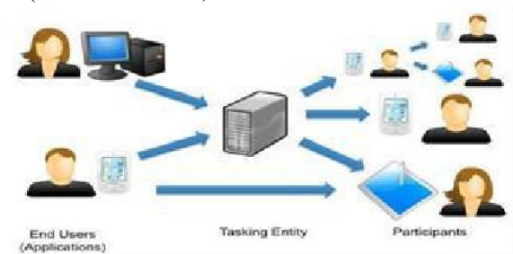
Fig. 1. Generic structure of task flow in MCS

context, noise level, and traffic conditions) collected by their sensor-enhanced devices, and more information can be collects in the cloud for large scale sensing and community intelligence mining [15]. Crowd sensing has