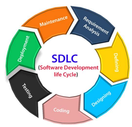
Figure 3. Phases of Information Systems Development

After a thorough analysis of the nature of projects and the way in which their execution is managed, as well as a detailed understanding of the information systems development cycle described in the previous section, it is imperative to amalgamate these fundamental concepts. The convergence of these two areas reveals an undeniable truth: the latent presence of risks that could undermine the efforts dedicated to each of these elements. This nuance highlights the crucial importance of risk management in the context of information systems projects. In fact, it is precisely in this conjunction that the central essence of this article is forged, as it reveals the irreplaceable relevance of accurate and effective risk management as a safeguard for information systems projects.