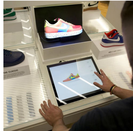
Figure 6. Personalized Nike House of Innovation store

where the customer feels that the store is truly tailored to them, increasing not only engagement but also loyalty and satisfaction. The personalized environment promotes feelings of exclusivity, leading to a deeper connection with the brand and higher sales results.