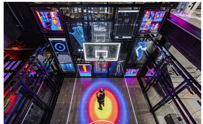
Figure 4. Personalized Nike House of Innovation store

Another way AI can influence retail and design is through the automatic creation of visuals and the customization of product displays. AI technologies can generate and edit visuals based on customer data, ensuring that visuals remain consistent while also being highly personalized. Nike uses advanced AI tools to automatically create digital visuals for its ads, product displays, and websites.