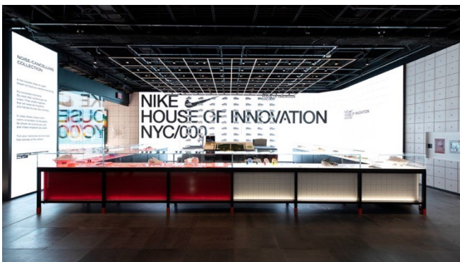
Figure 5. Personalized Nike House of Innovation store

The Nike store in New York collects and uses extensive information about customers who log into the app—from their favorite colors and sports to their shoe size. This customer engagement system then uses this data to provide a highly personalized and quality shopping experience. So, they log in when they enter the store, and the store changes according to their preferences. Nike uses this information to optimize inventory in individual stores, deciding which sneaker models should be available in specific locations. The app also allows customers to scan clothing in the store and immediately request that the desired item in their size be sent to the fitting room [14].