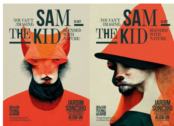
Figure 2. Use of AI in creating a campaign for a festival in Portugal

with new solutions, as AI can now take over routine tasks almost entirely. AI can help them generate design variations, edit photos, and create vector graphics [5] and other marketing materials tailored to specific target groups and current market conditions. This process reduces the time needed to create visuals while ensuring that designs are in line with current trends and customer needs [6]. An example of this is a campaign for a festival in Portugal, which brought together nature, artists, and AI [12]. The result was an avant-garde, artistic, and differentiated campaign in line with the values of this electronic music festival.